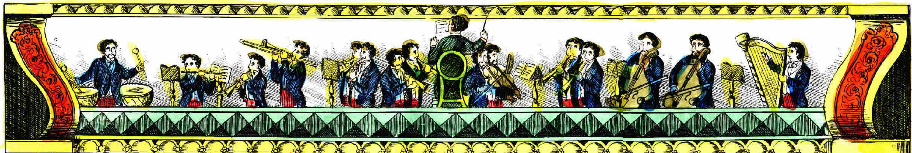
Price Two pence Plain