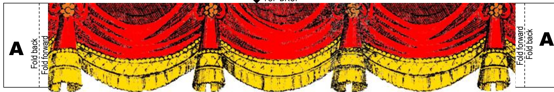
↓ TOP DROP